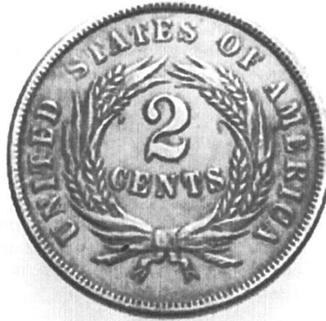
The Inspiration of Our Newsletter The 1864 US Two Cent Piece